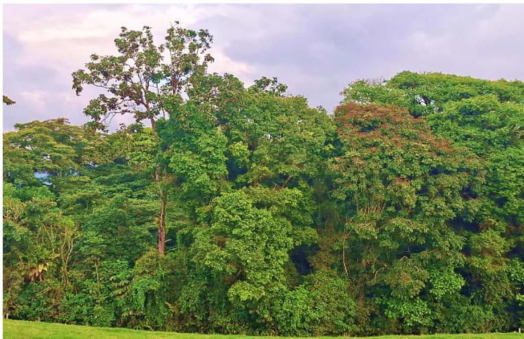
Magnolia hernandezii and Magnolia gilbertoi forest remnants

Stretching across the Andean slopes, these ecosystems are shaped by the snow-capped peaks and thermal springs of Los Nevados National Natural Park in the Central Range, the exuberant biodiversity of Tatamá National Natural Park in the Western Range, and the warm dry forests of the Cauca River Valley.